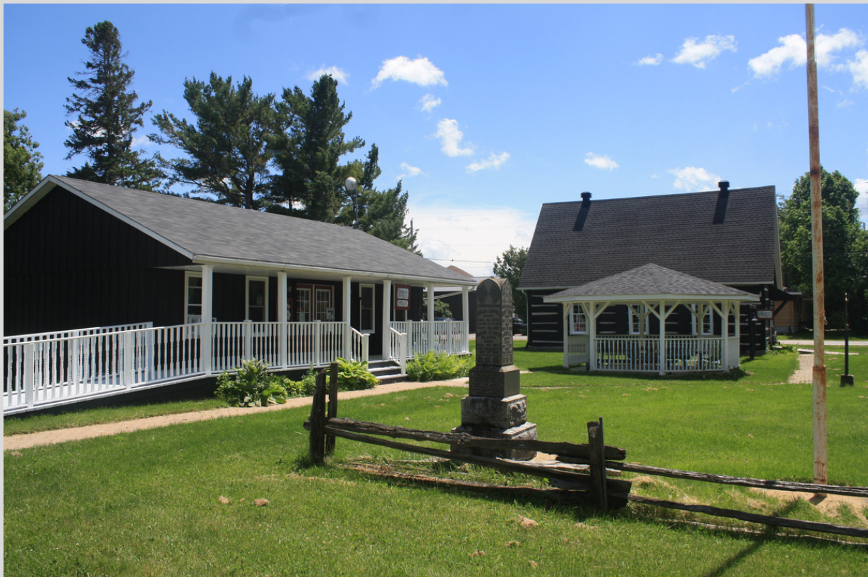
View from the museum's parking lot of the Office/Gift Shop , gazebo and Church building, with the cenotaph in the foreground.