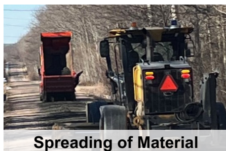
Spreading of Material