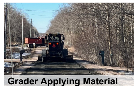
Grader Applying Material