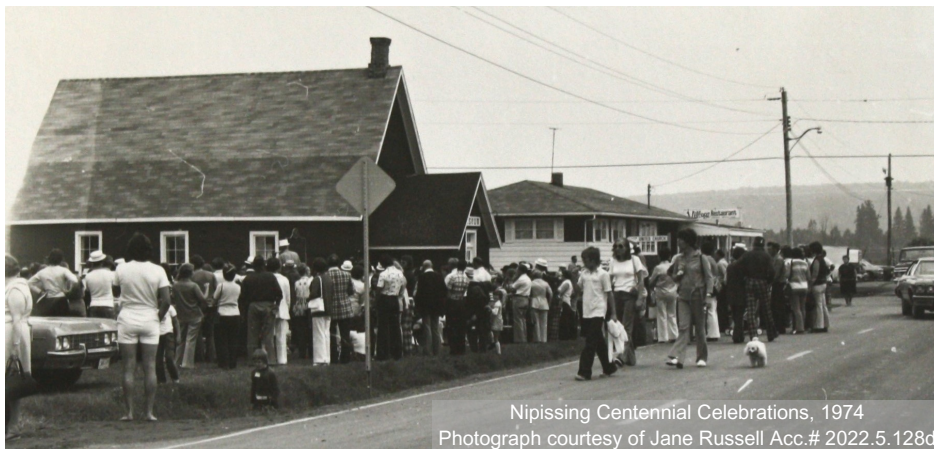
Nipissing Centennial Celebrations, 1974

The former Methodist (later Anglican) Church located at the corner of Hwy 654 and Beatty St. is one of three main buildings that house and display the Nipissing Township Museum collections. It was first opened to the public as a museum during the Nipissing Centennial Celebrations in August 1974.