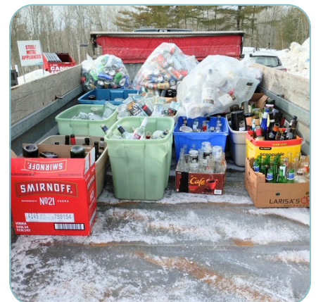
Bottle Drive Donations