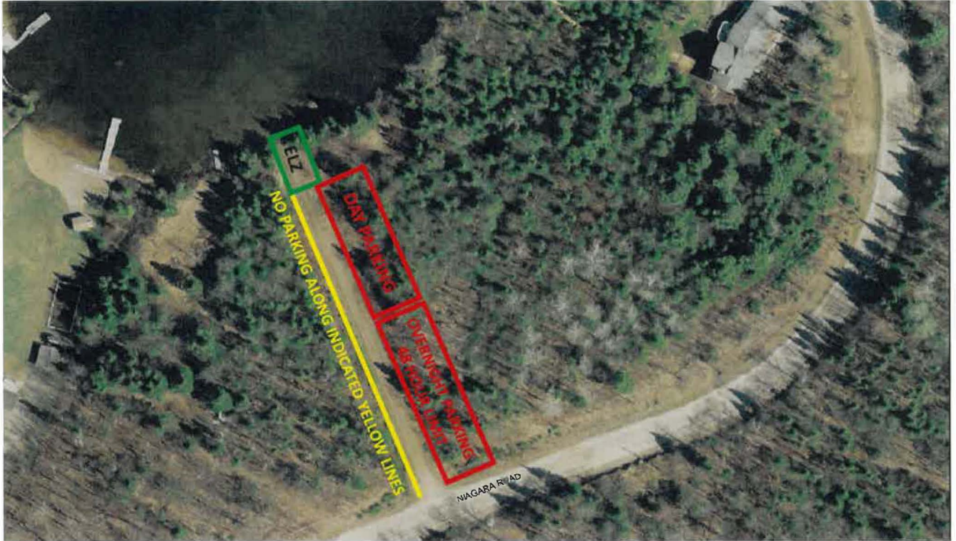
Reference Illustration #7