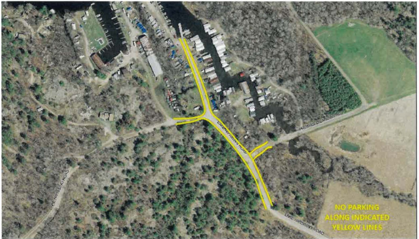
Reference Illustration #4