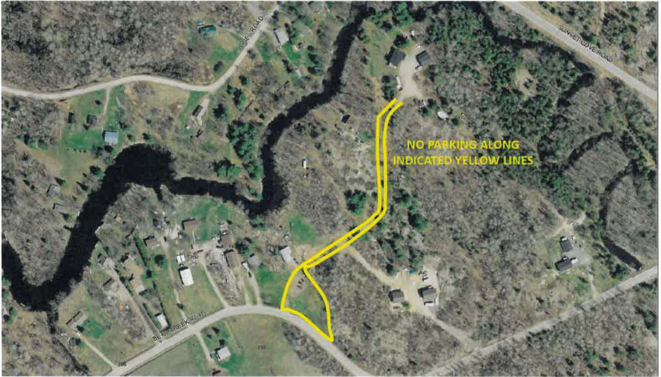
Reference Illustration #3