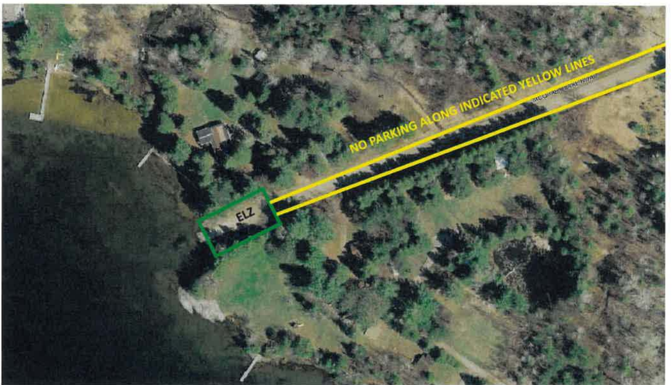
Reference Illustration #6