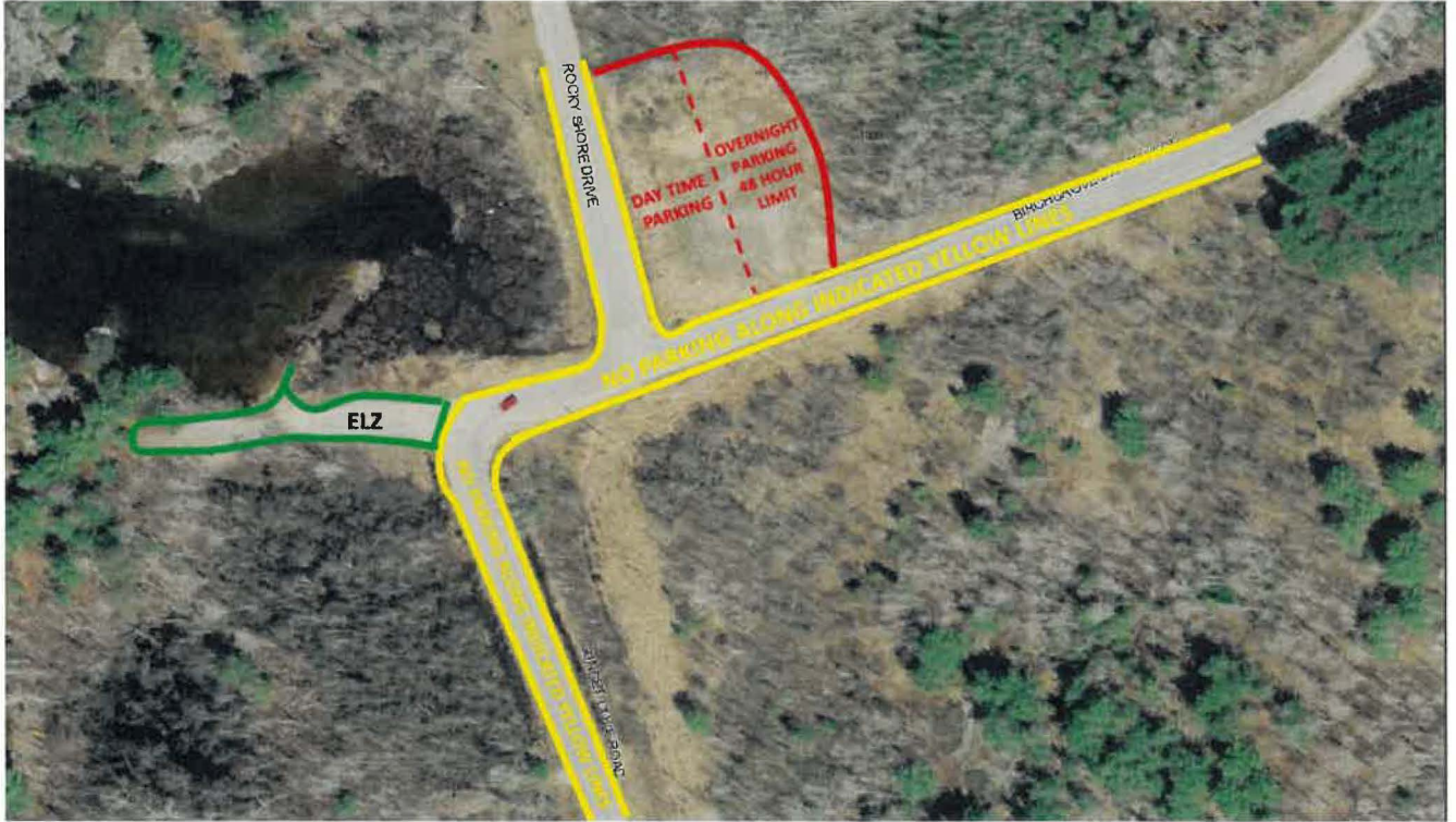
Reference Illustration #1