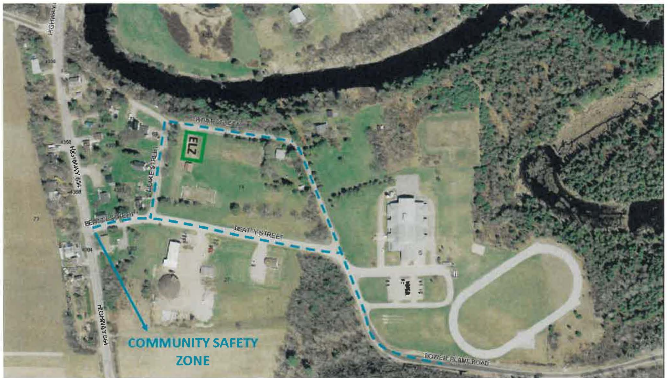
Reference Illustration #10