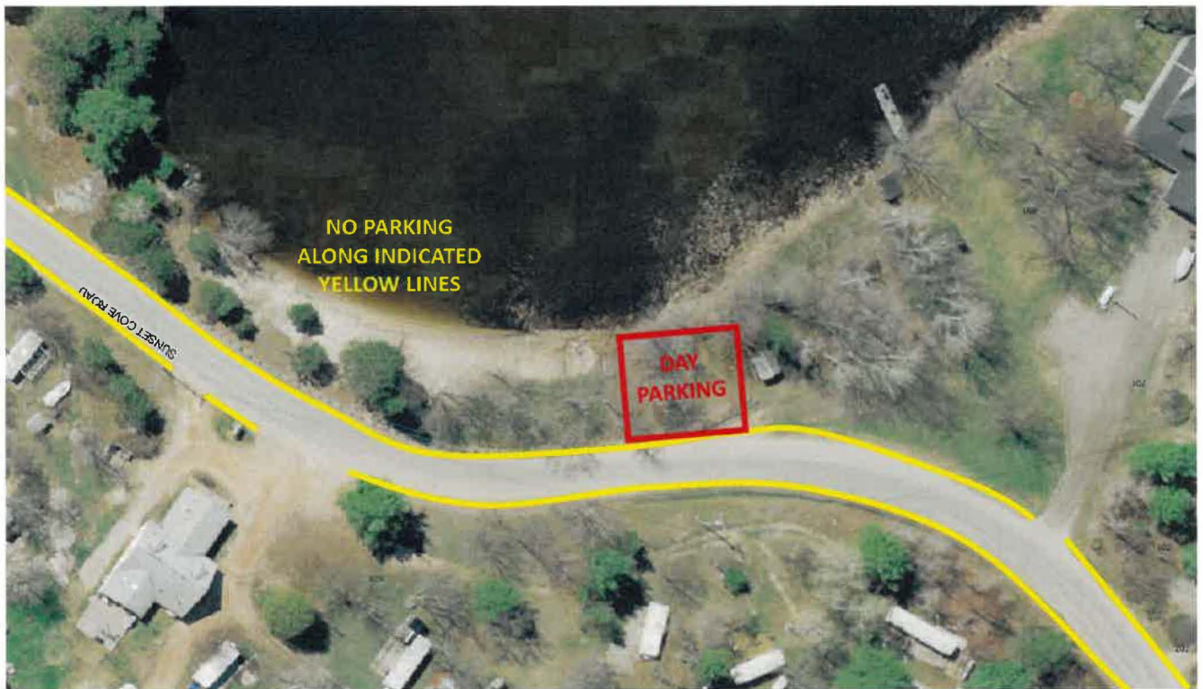
Reference Illustration #8