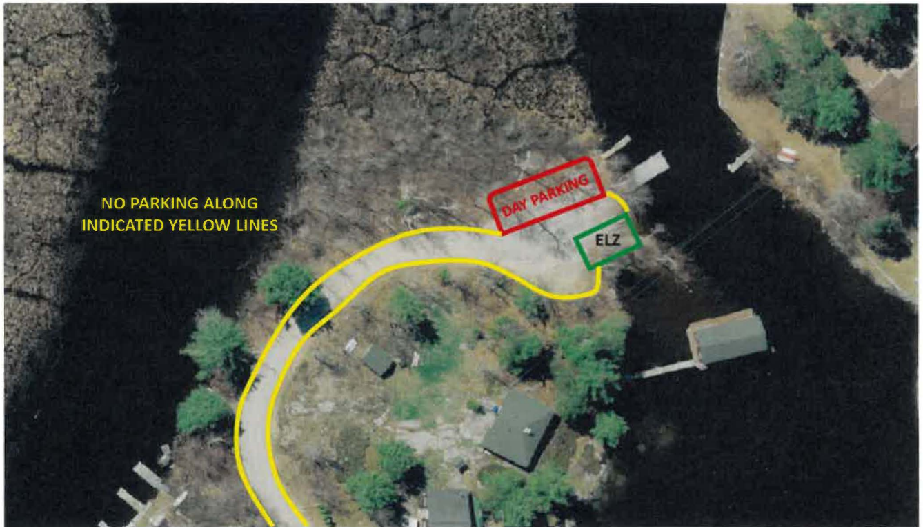
Reference Illustration #2