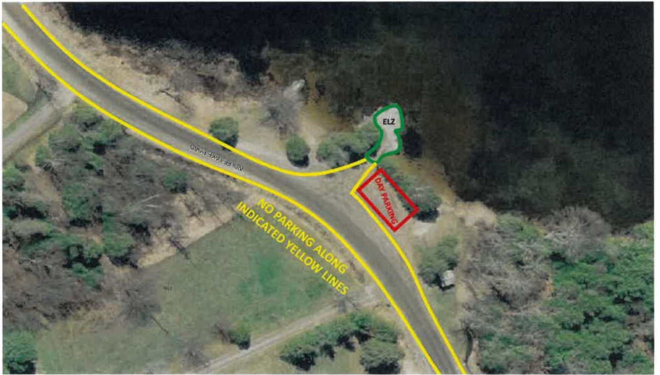
Reference Illustration #9